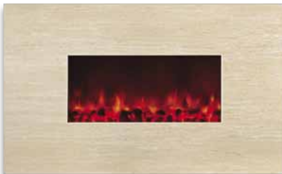
E. DF-EFP800 ADOBE 38 ELECTRIC FIREPLACE

Polished Faux Travertine Finish 38" W x 25½" H x 6" D 46 lbs. gross weight