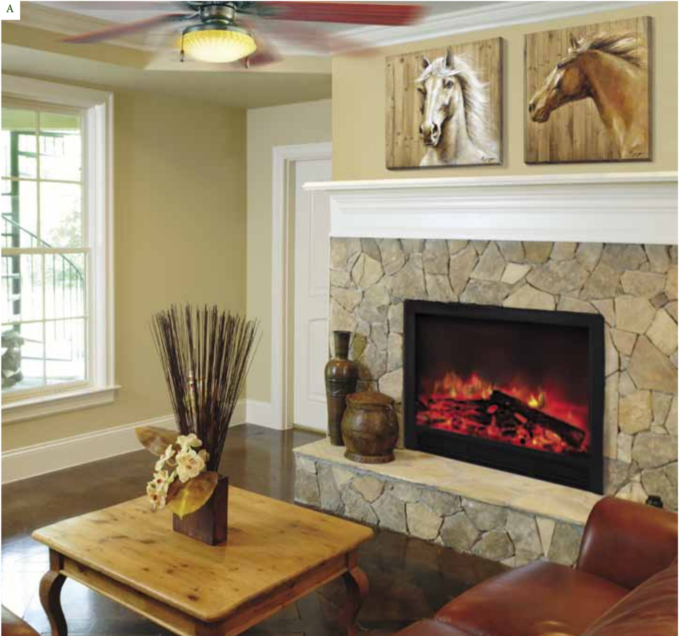
Artwork pictured above may be found in our Artwork Collection items #FCK8294B-1 & #FCK8294B-2

Yosemite Home Décor Electric Fireplace Inserts can help save you thousands of dollars over the cost of a traditional brick and mortar unit. Go green with our energy efficient units and reduce your carbon footprint while still enjoying the comforts of a fireplace year round. We are proud to offer you electric fireplace inserts that will fit beautifully into any application. All units feature temperature control and come equipped with child safe glass that remains cool to the touch.