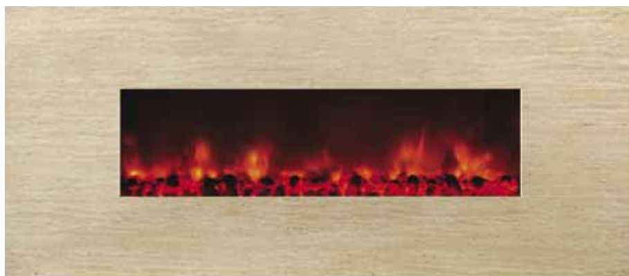
G. DF-EFP620-SS ARIES 24 ELECTRIC FIREPLACE

Full Metal Construction Stainless & Black Finish 25½" W x 20½" H x 8½" D 30 lbs. gross weight