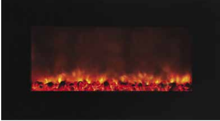
A. DF-EFP1830G WIDE SCREEN ELECTRIC FIREPLACE Full Metal Construction with Wide Glass Opening 39½" W x 21¼" H x 5¼" D 63 lbs. gross weight